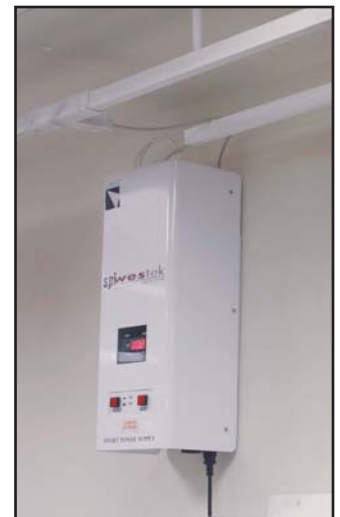
IRIS smart power supply