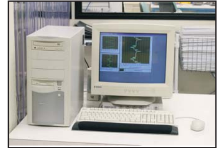
IRIS controlled by personal computer

Output performance is monitored directly, verifying the ionization production measured at calibration. System operation is also continuously monitored with unusual events appended to a time-stamped log. If a fault is detected, such as an out-of-balance condition, audible alarms on both the power supply and software application are sounded and system messages are displayed. In such an event, the power supply is automatically disabled. Simple log review pinpoints the problem for quick error correction so that operation can be resumed.